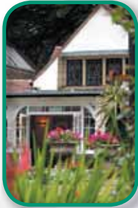
Harry Edwards Healing Sanctuary

The PHP is a positive health and well-being programme developed for people living with cancer. The PHP enables people to manage and maximise all aspects of their health, focusing on each person's strengths whilst also honouring the challenges that have arisen from the health experience.